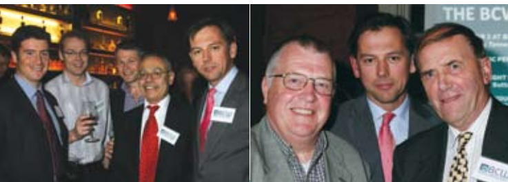
Guests at the Launch of Bowel Cancer West